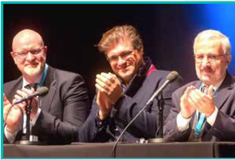
"Local" organisers of the XXIII ESSFN Congress in Edinburgh