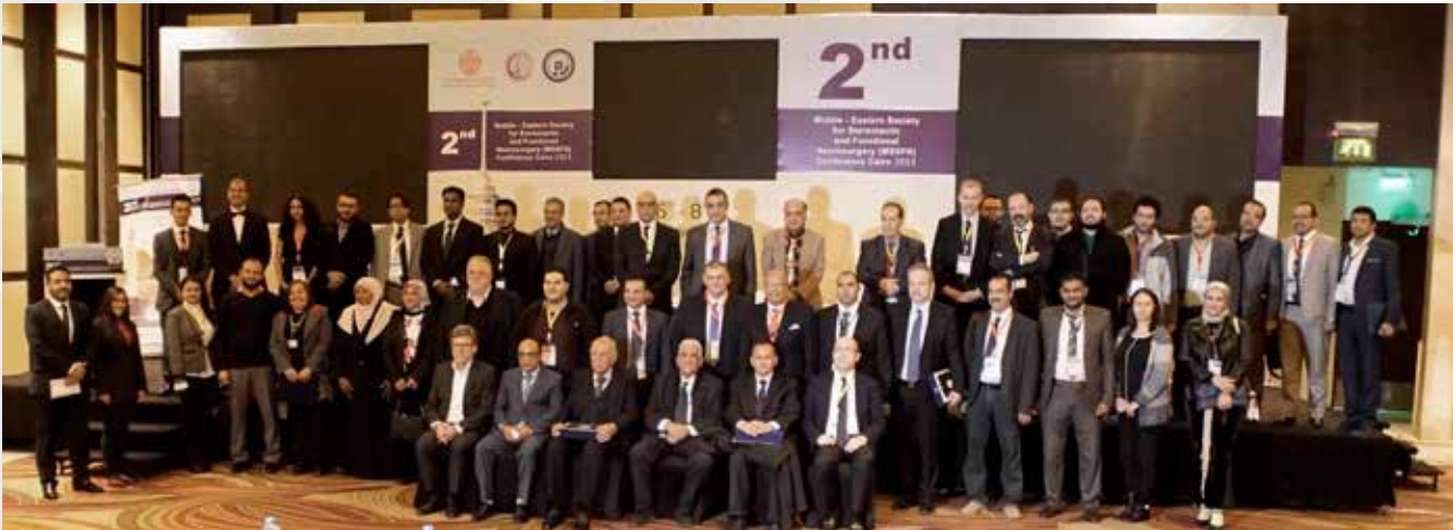
The attendees at the Cairo 2019 MSSFN conference